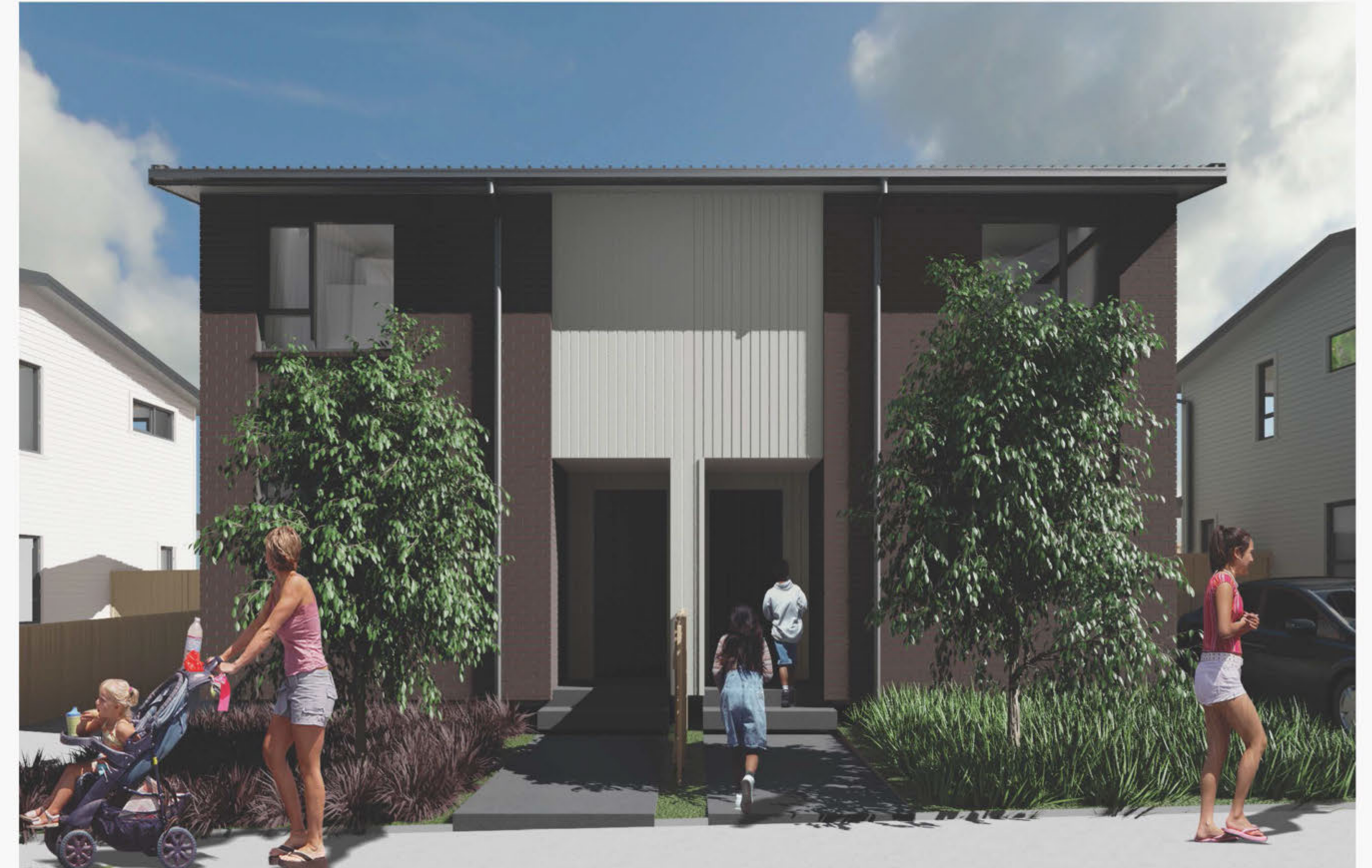
2B Duplex Example with Dark Brick / White Weatherboard Cladding