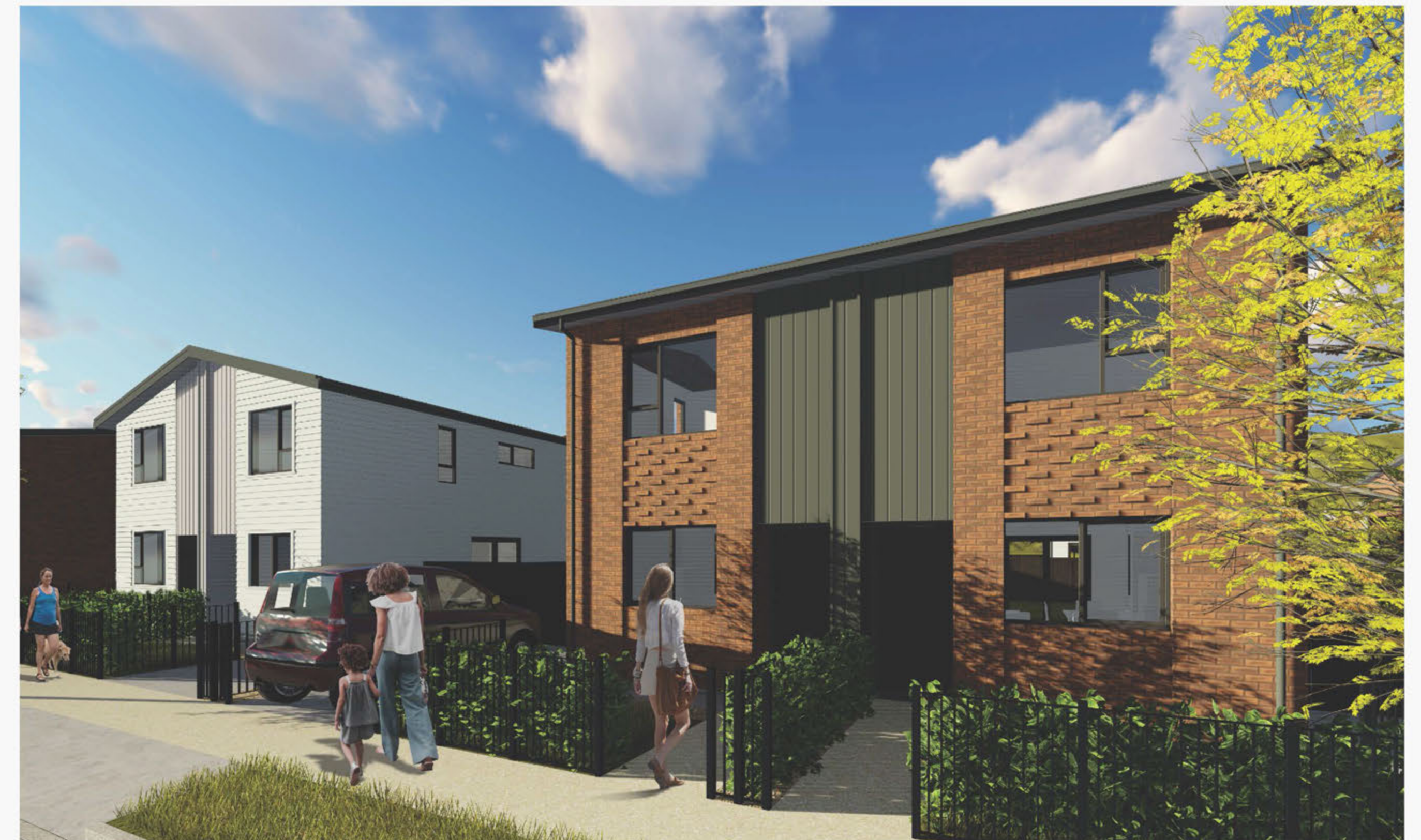
2B Duplex Example